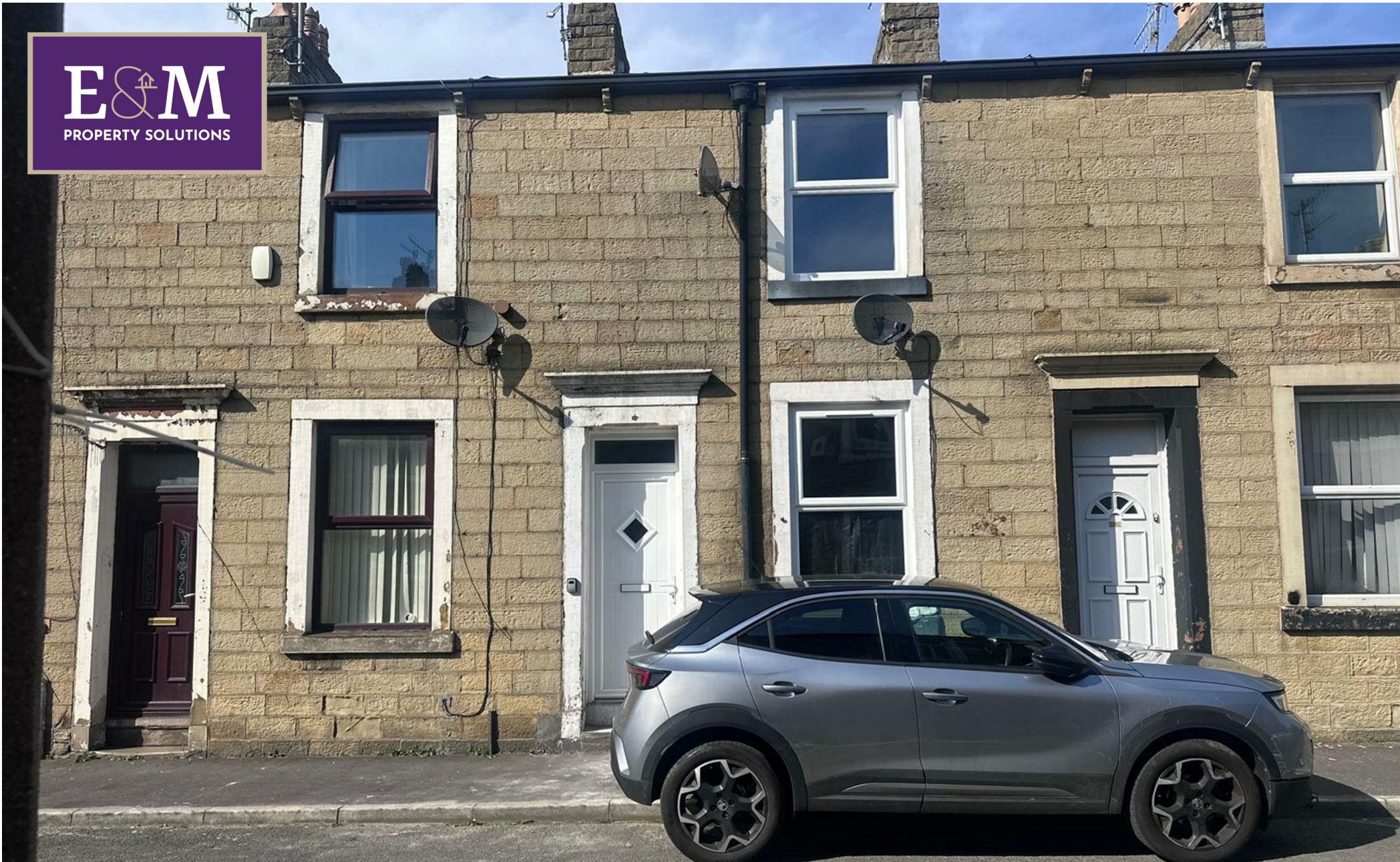
21 Pine Street, Burnley, BB11 3AE £625 Per month