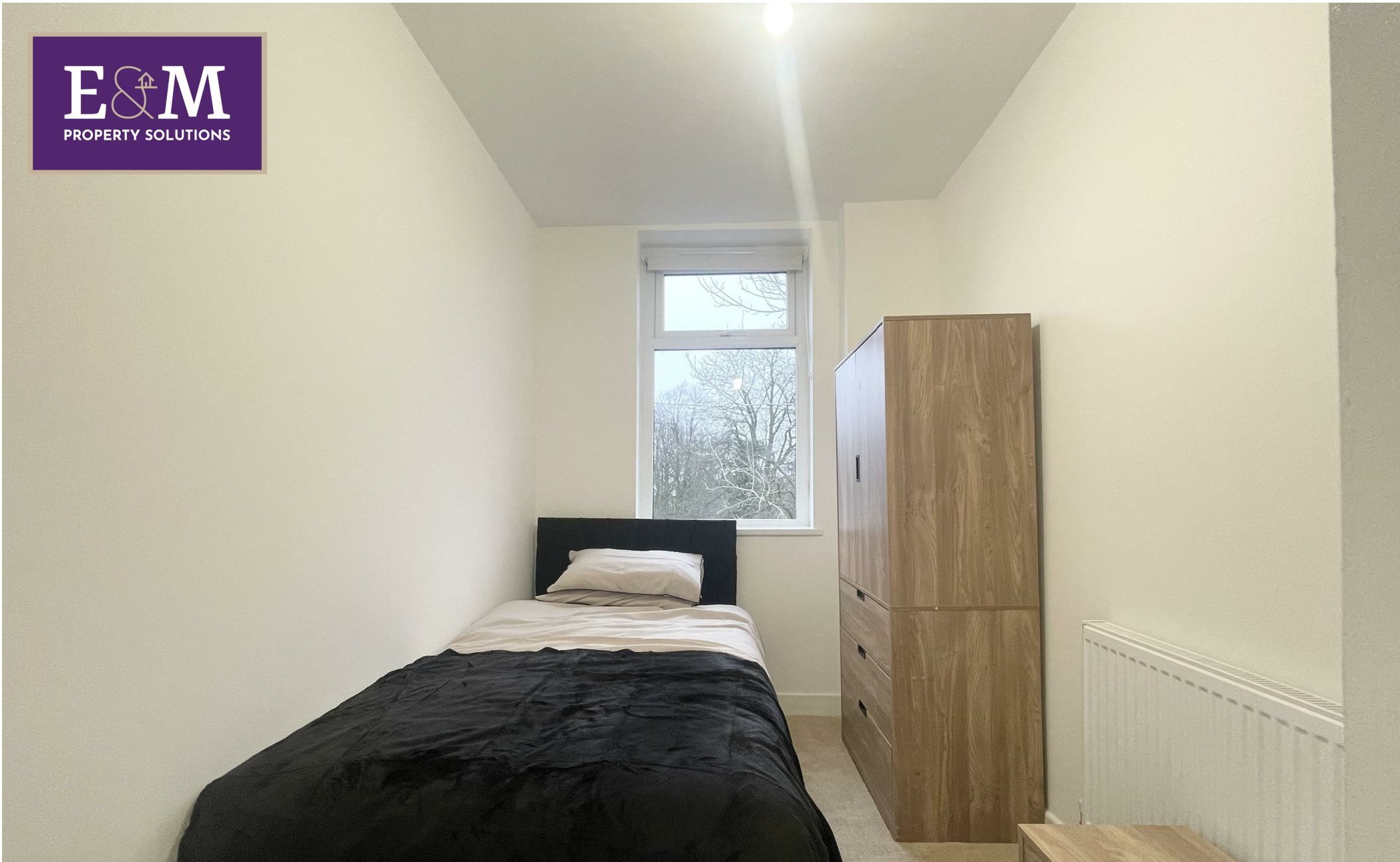
ROOM 5, 157 Coal Clough Lane, Burnley, BB11 4NJ £95 Per week