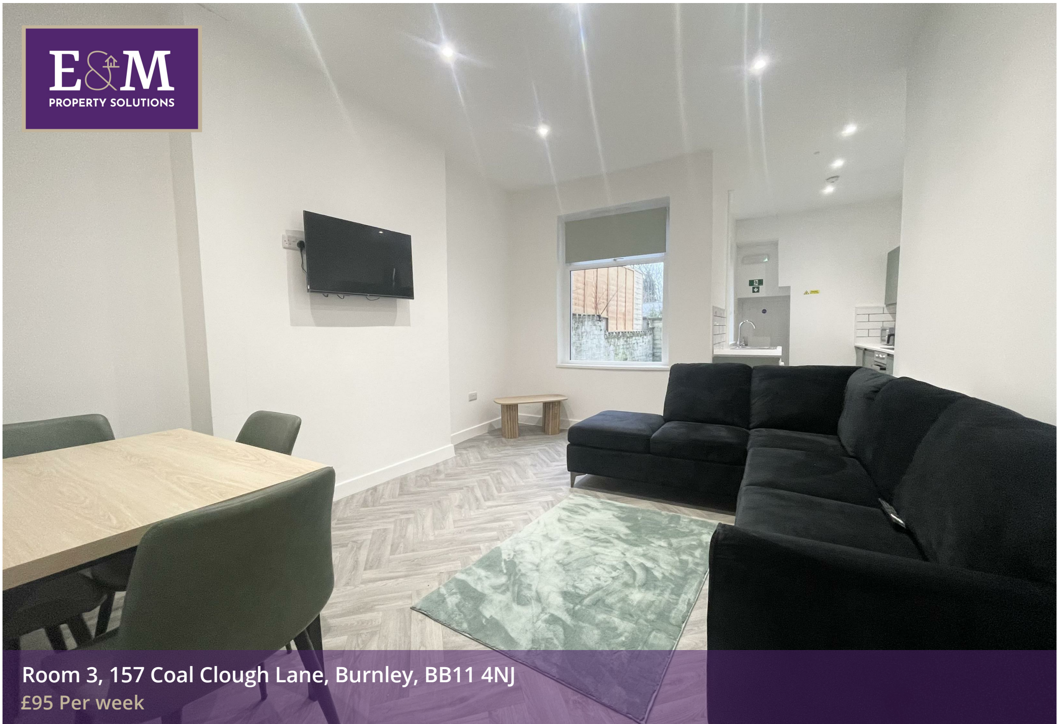
Room 3, 157 Coal Clough Lane, Burnley, BB11 4NJ £95 Per week