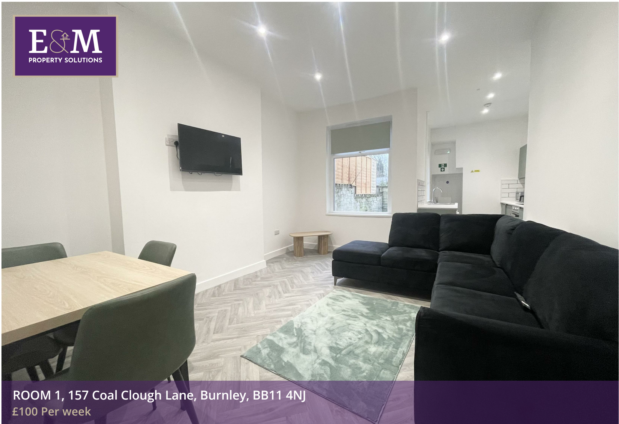
ROOM 1, 157 Coal Clough Lane, Burnley, BB11 4NJ £100 Per week