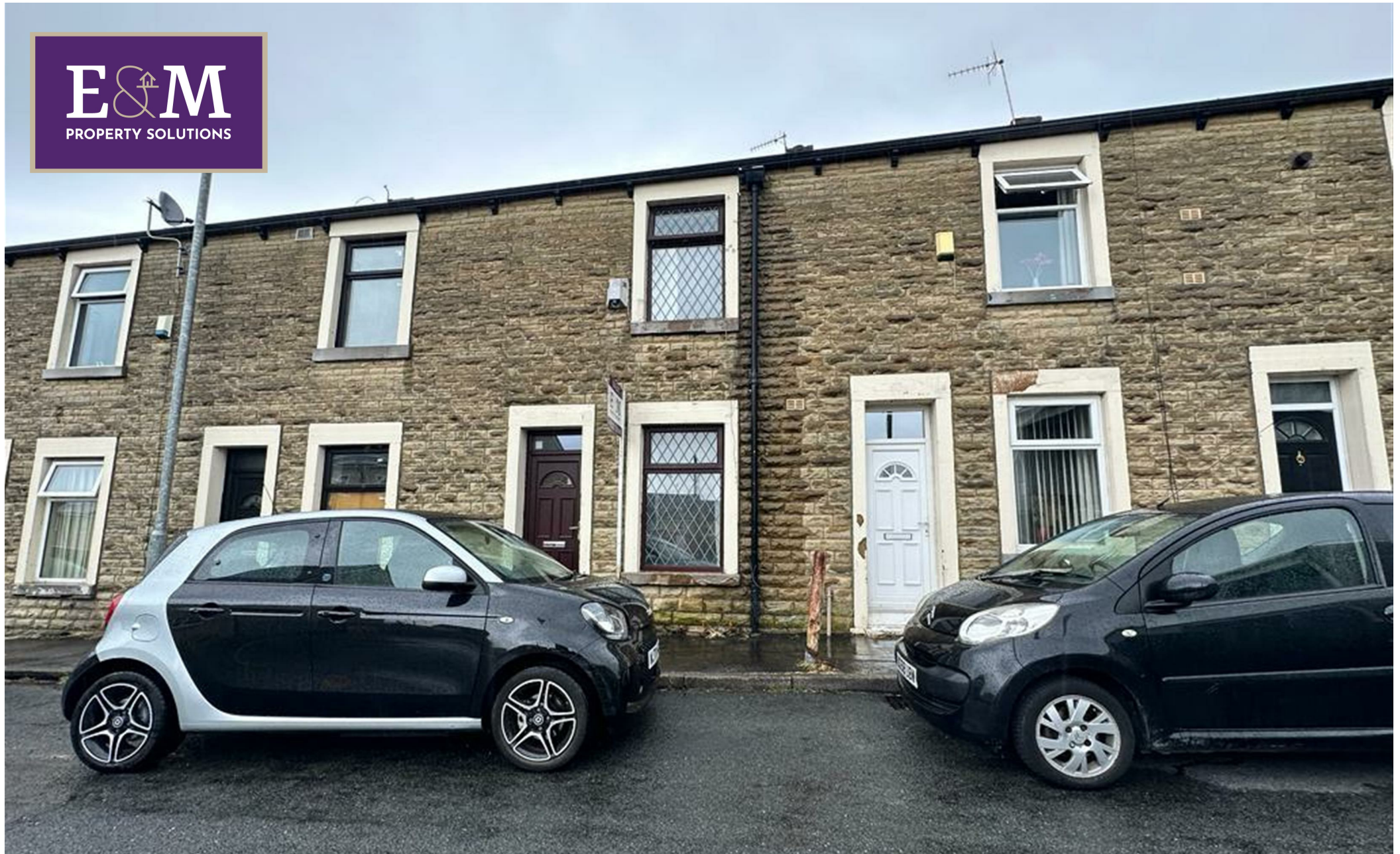
8 Bruce Street, Burnley, Lancashire, BB11 4BL Asking price £65,000