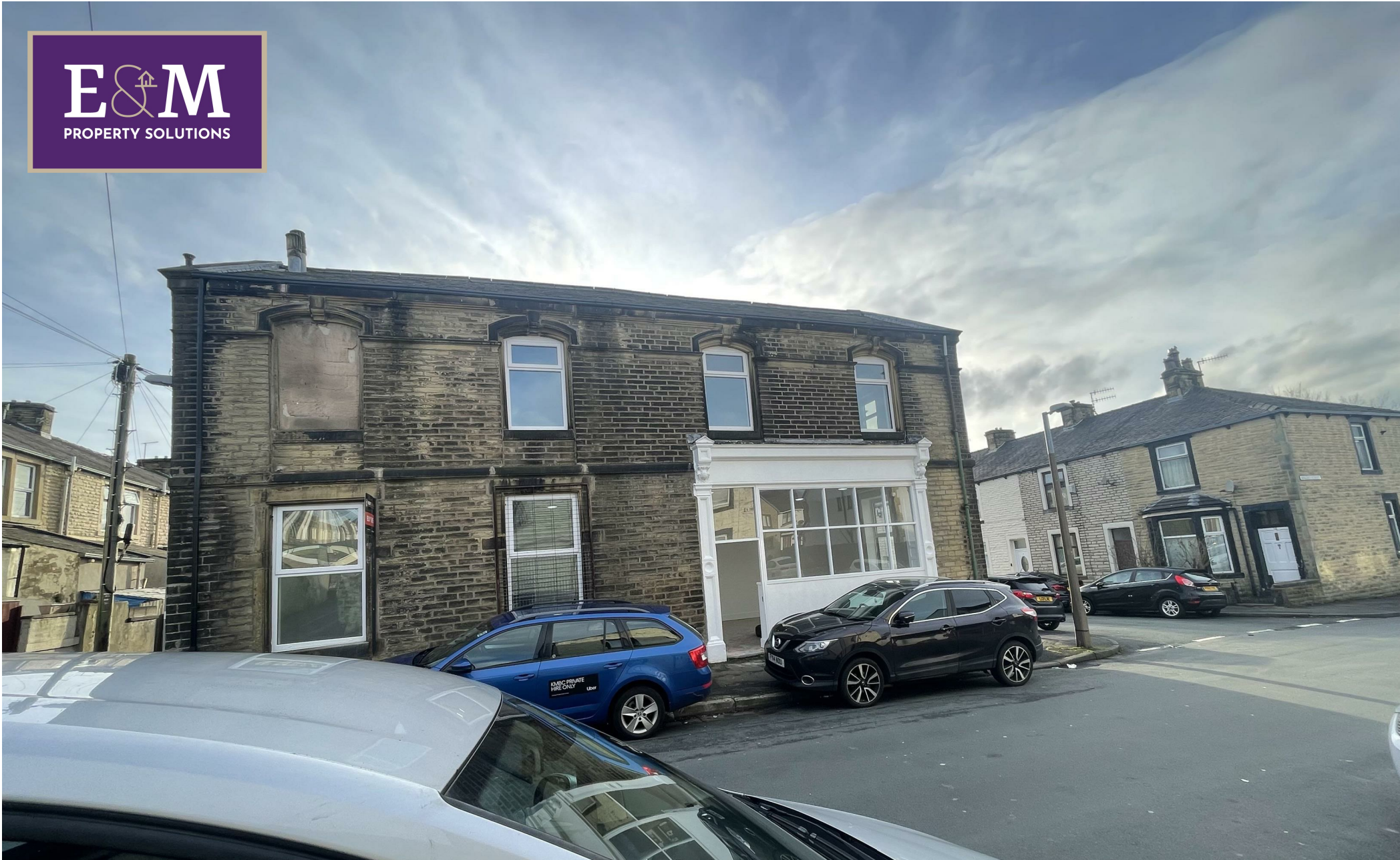
4 Bright Street, Burnley, BB10 1RX Offers in the region of £174,995