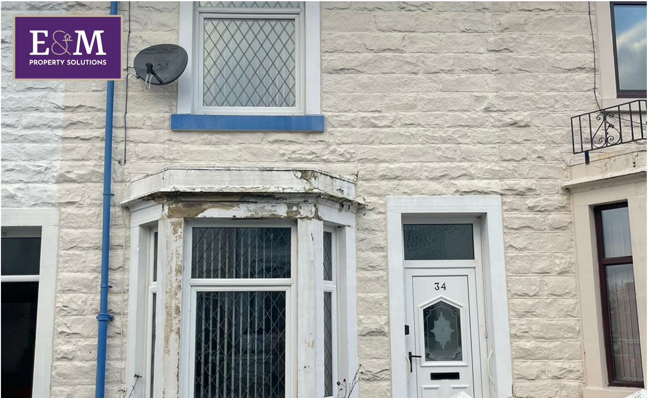
34 Shakespeare Street, Padiham, Burnley, Lancashire, BB12 8RG Asking price £84,995