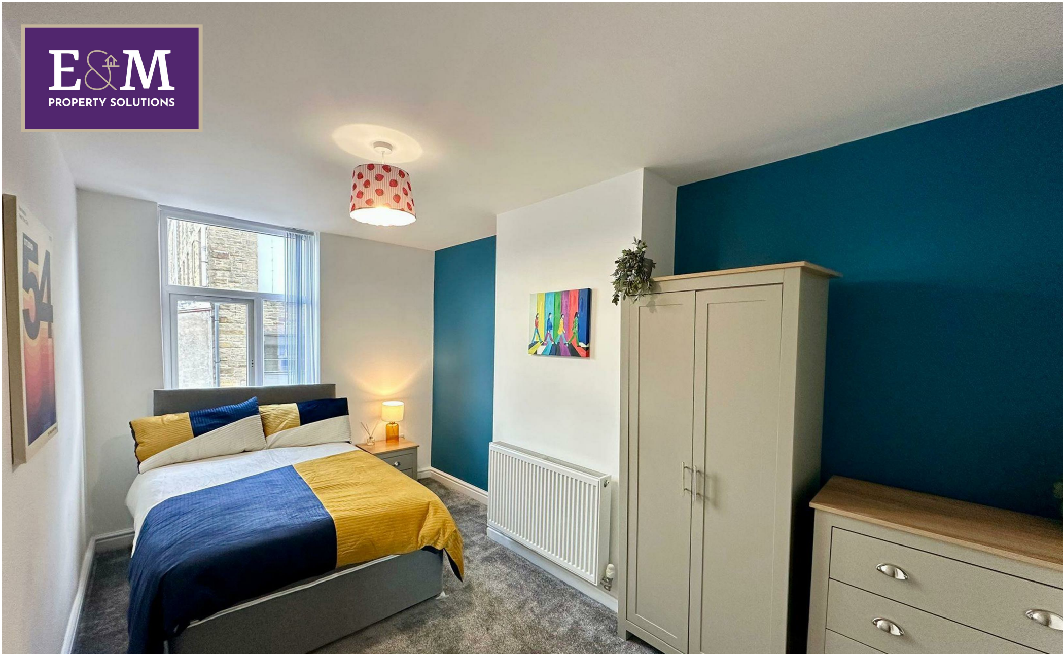
Room 4, 97 Derby Street, Colne, Lancashire, BB8 9AF £115 Per week