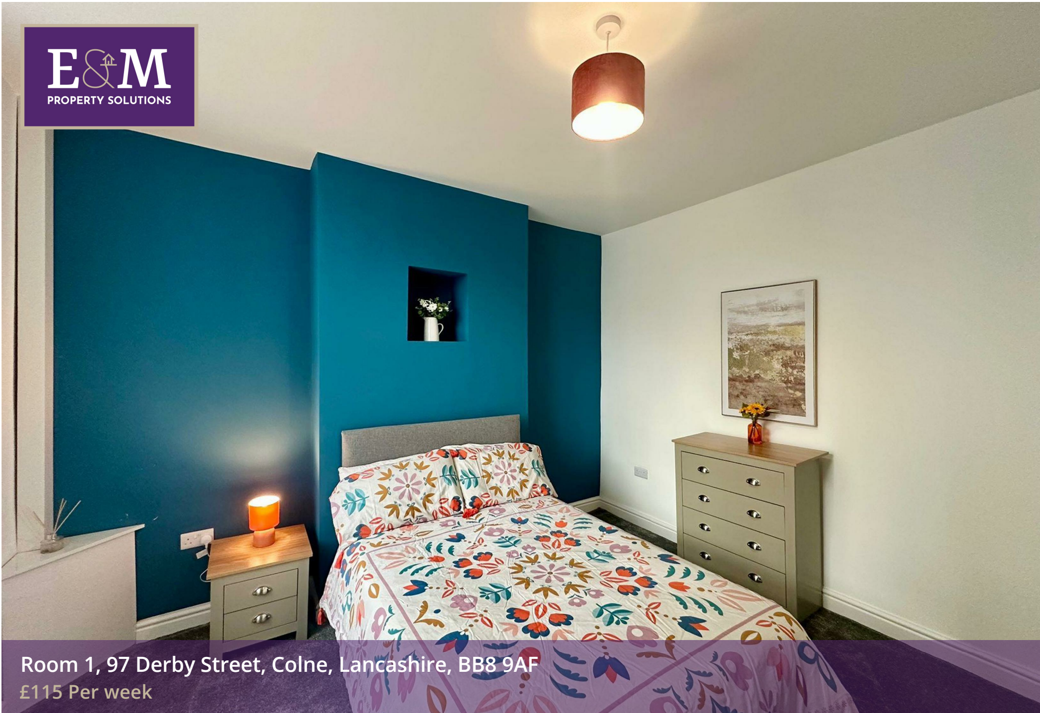
Room 1, 97 Derby Street, Colne, Lancashire, BB8 9AF £115 Per week