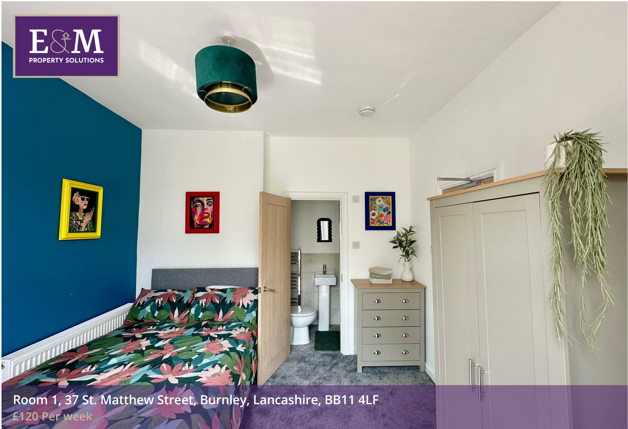
Room 1, 37 St. Matthew Street, Burnley, Lancashire, BB11 4LF £120 Per week