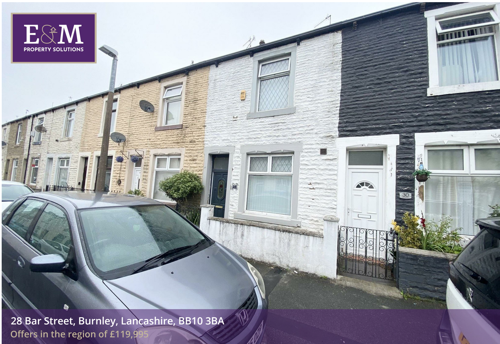
28 Bar Street, Burnley, Lancashire, BB10 3BA Offers in the region of £119,995