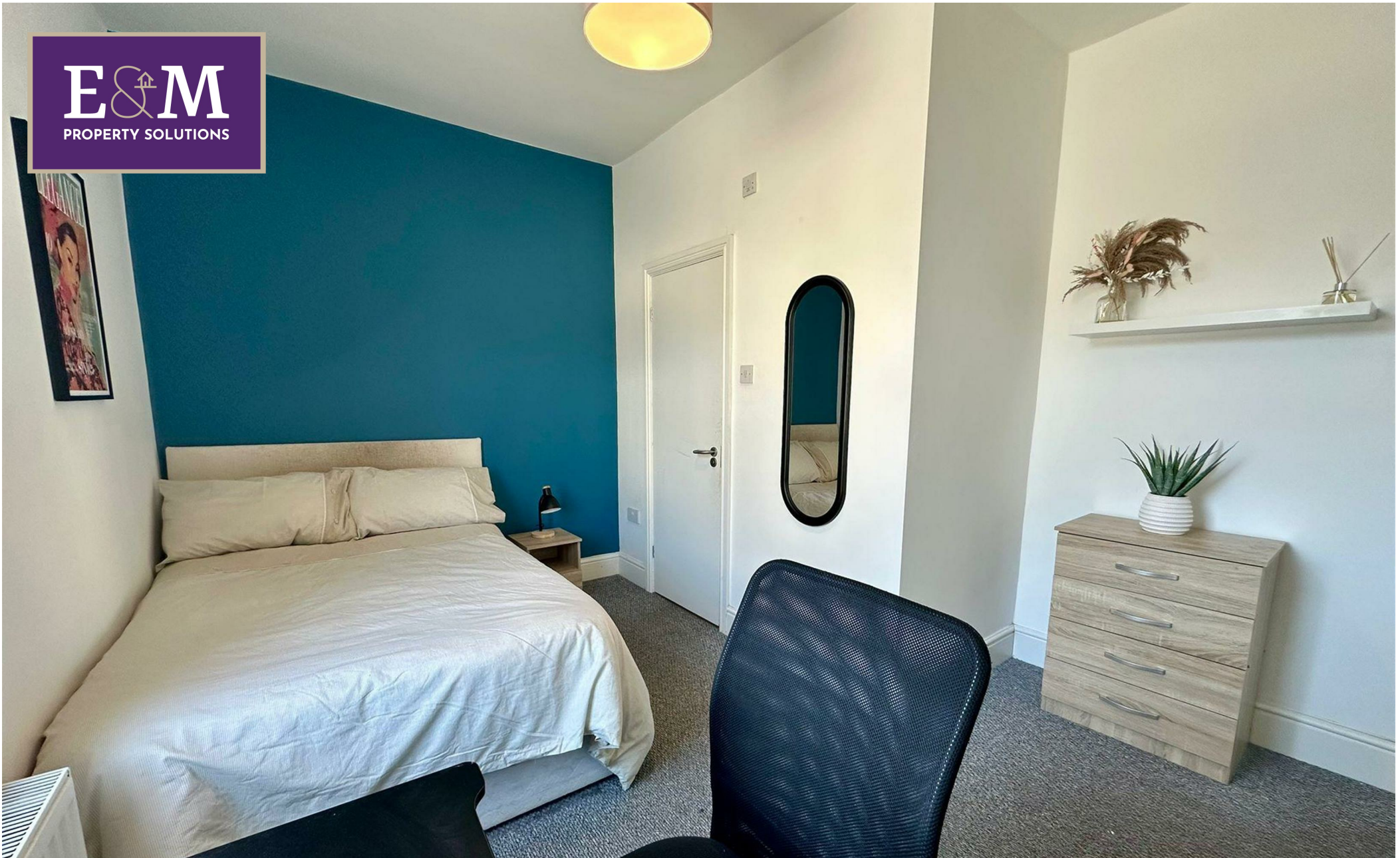
Room 3, 48 Coultate Street, Burnley, Lancashire, BB12 6RF £115 Per week