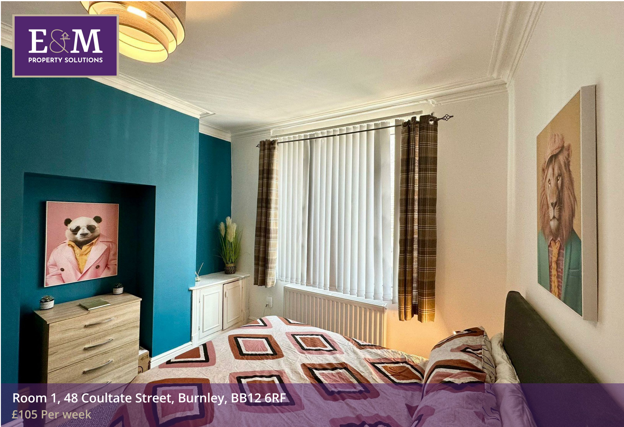
Room 1, 48 Coultate Street, Burnley, BB12 6RF £105 Per week