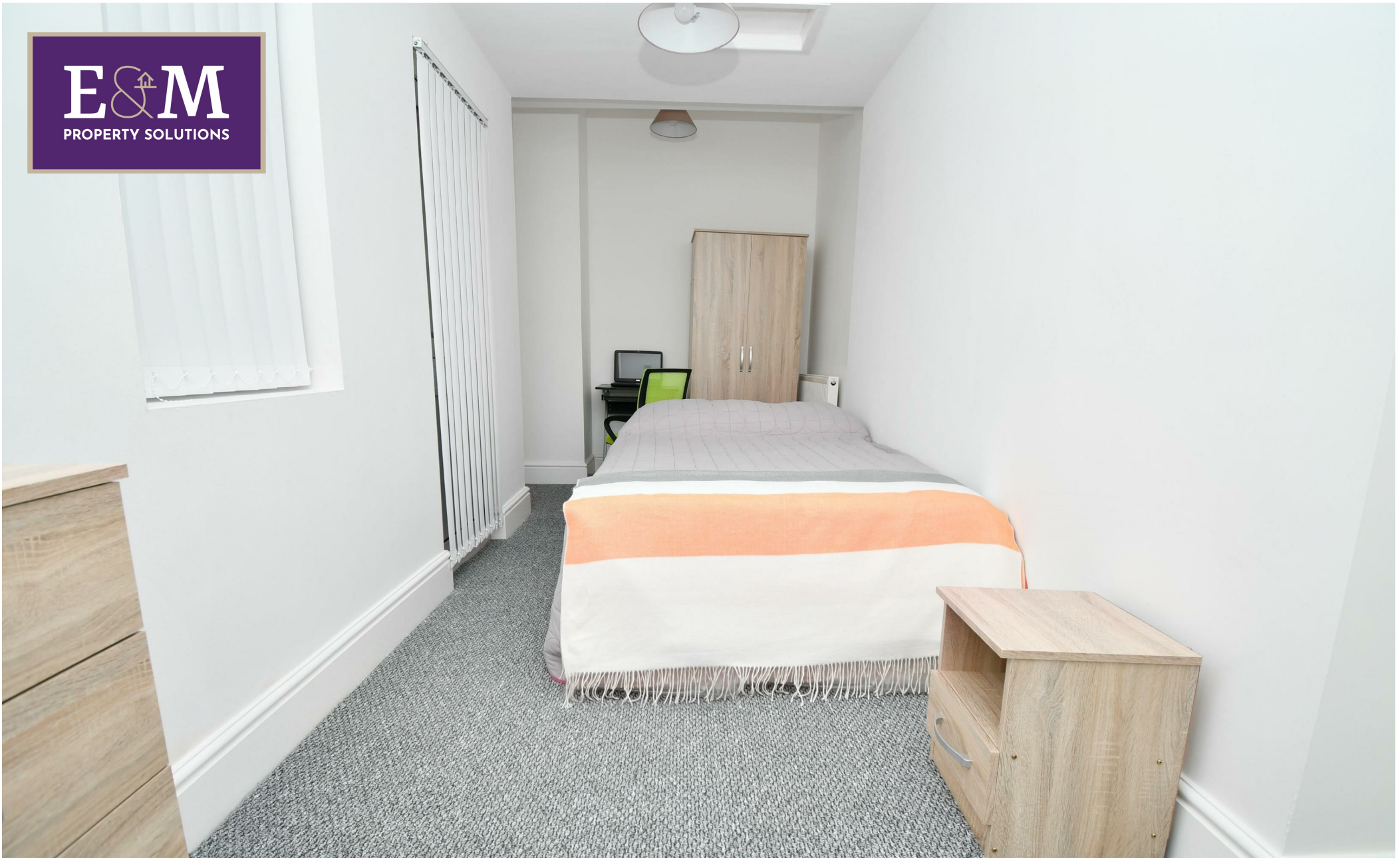
ROOM 2, 19 Netherby Street, Burnley, Lancashire, BB11 4NR £105 Per week