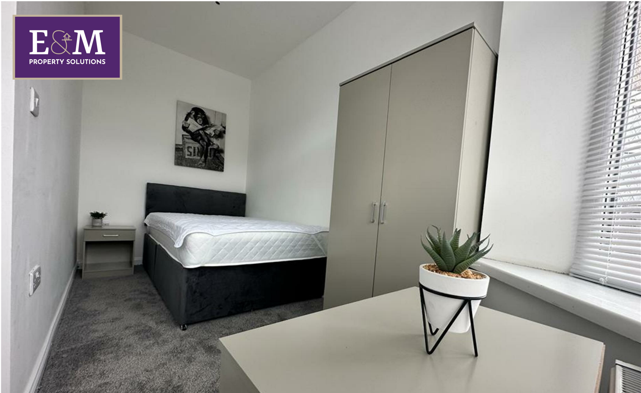
ROOM 1, 369 Brunshaw Road, Burnley, Lancashire, BB10 3HX £90 Per week