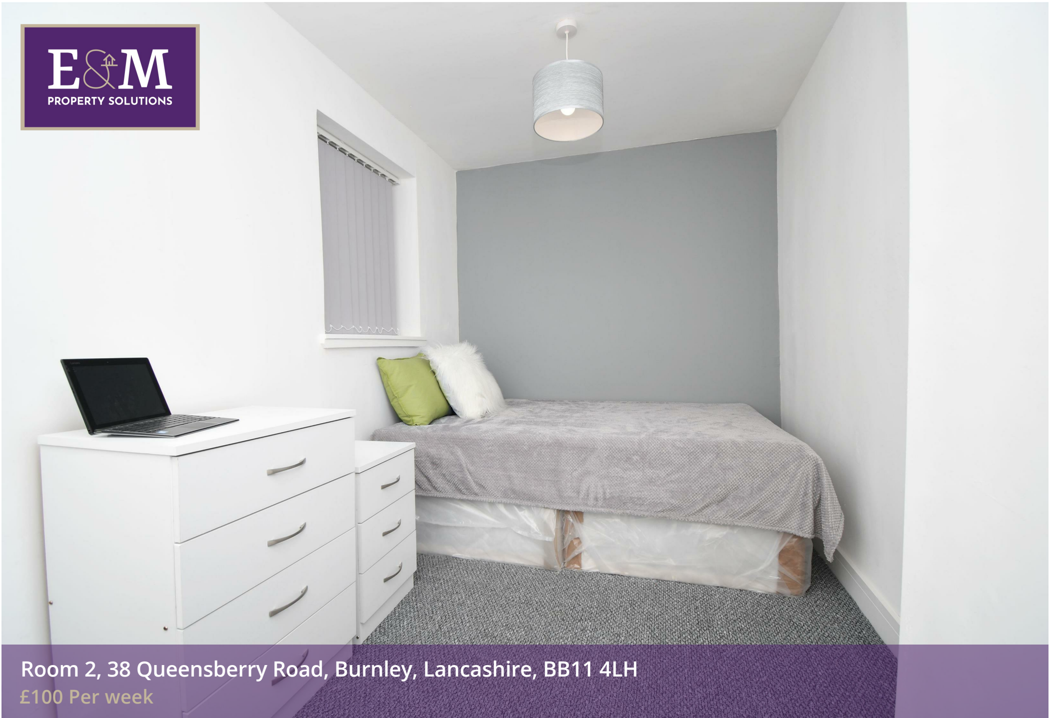
Room 2, 38 Queensberry Road, Burnley, Lancashire, BB11 4LH £100 Per week