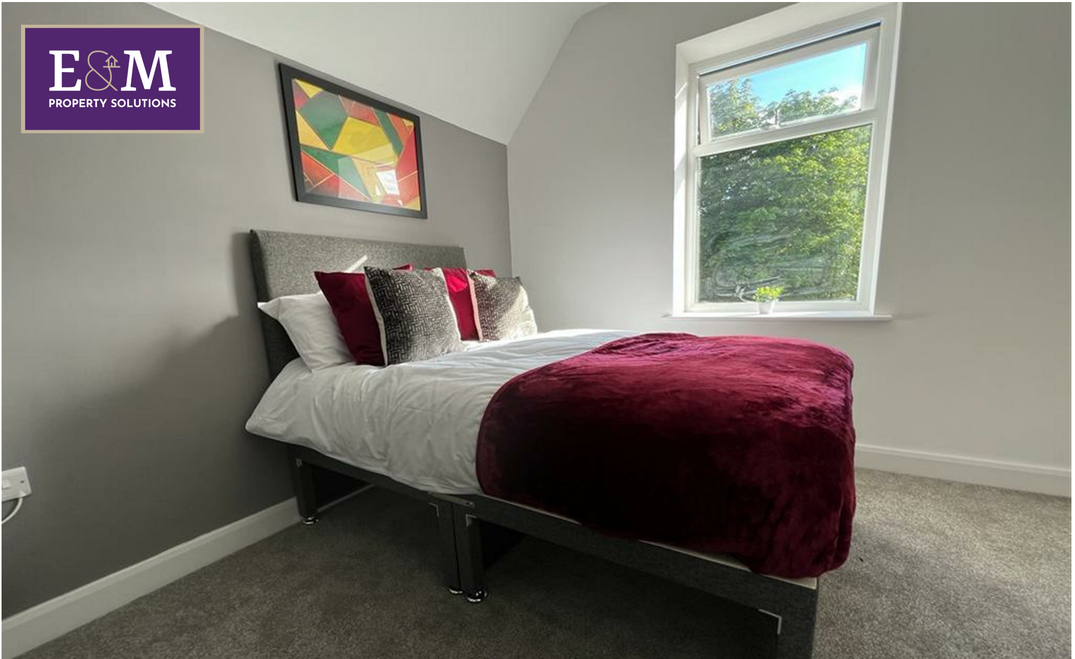
Room 7, 79-81 Church Street, Burnley, Lancashire, BB11 2RS £100 Per week