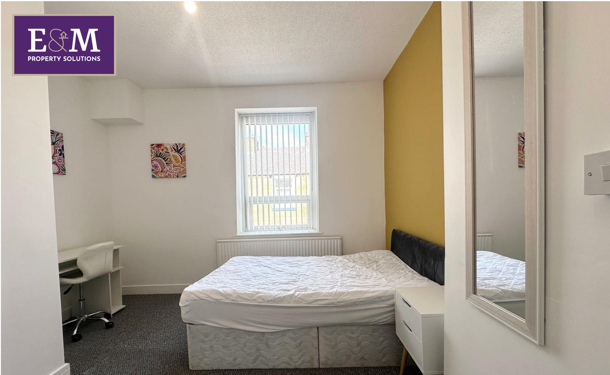
Room 6, 2-4 Fir Street, Burnley, Lancashire, BB10 4AL £115 Per week