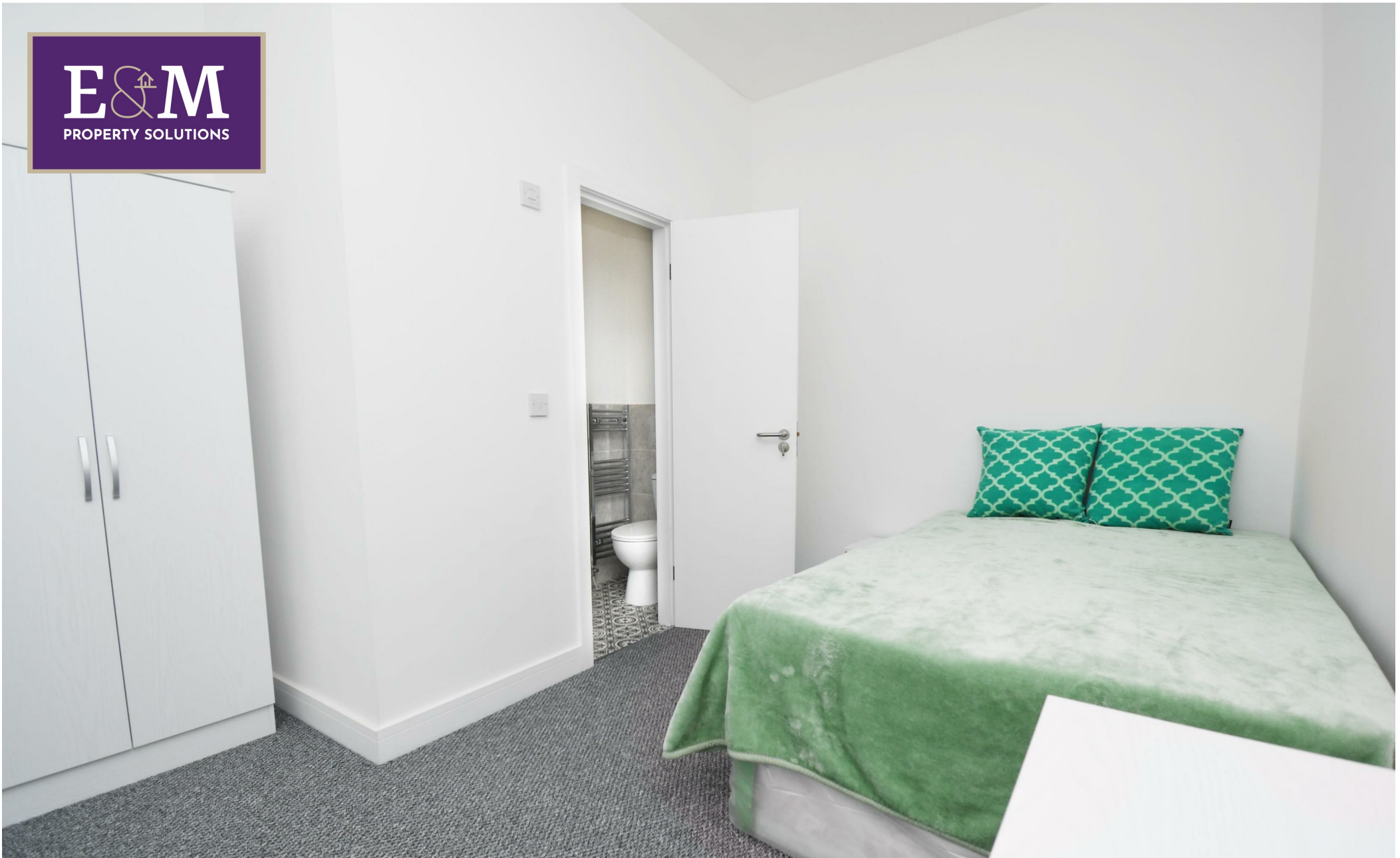
Room 3, 10 Berry Street, Burnley, Lancashire, BB11 2LG £115 Per week