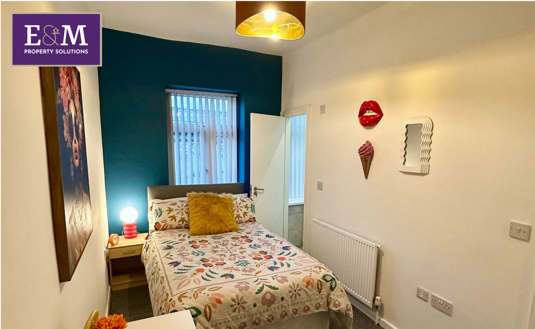
Room 3, 27 Nairne Street, Burnley, Lancashire, BB11 4BT £105 Per week