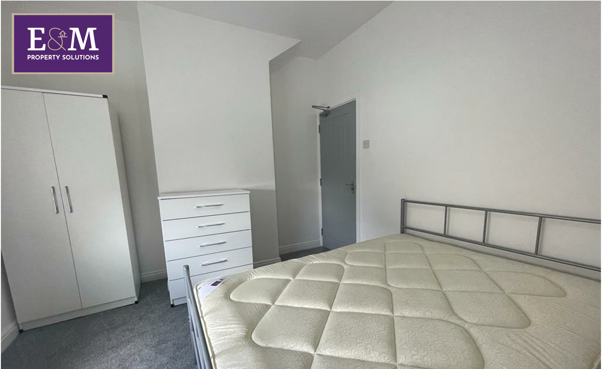
Room 1, 89 Nairne Street, Burnley, Lancashire, BB11 4PE £100 Per week