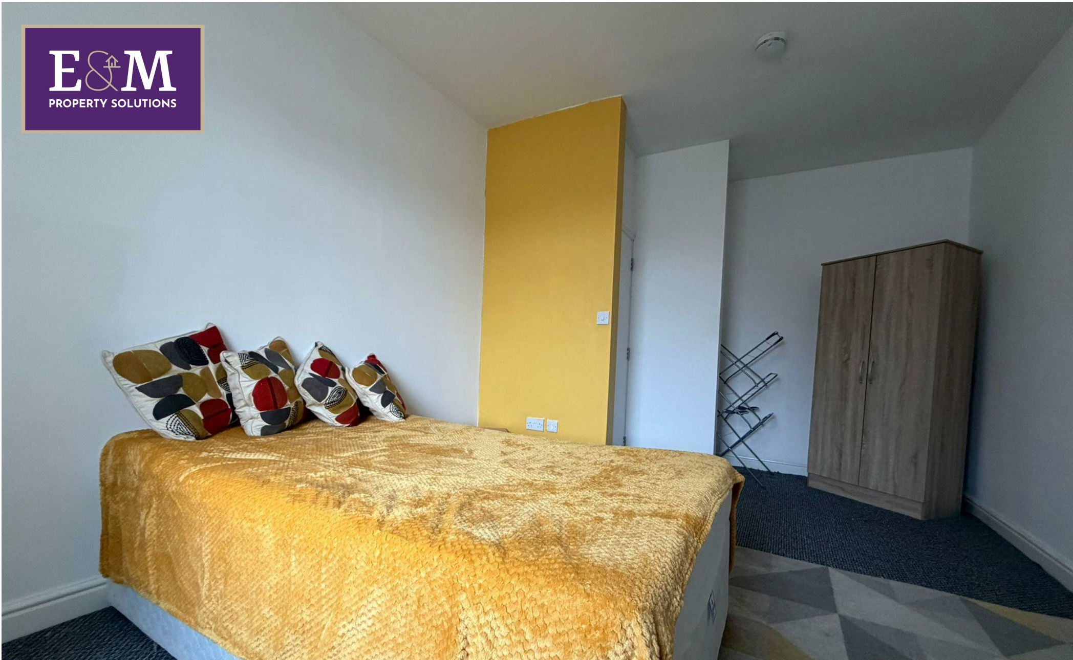
Room 4, 72 St. Matthew Street, Burnley, Lancashire, BB11 4JU £100 Per week