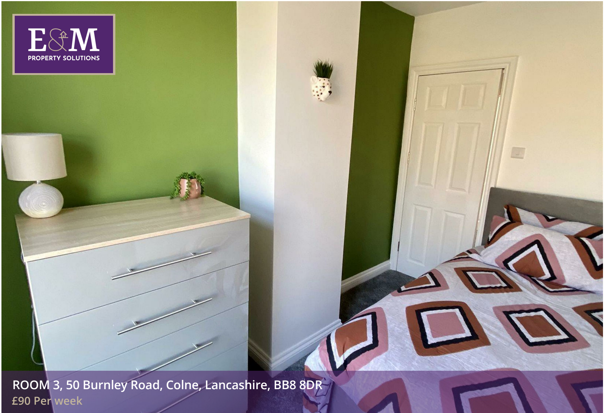
ROOM 3, 50 Burnley Road, Colne, Lancashire, BB8 8DR £90 Per week