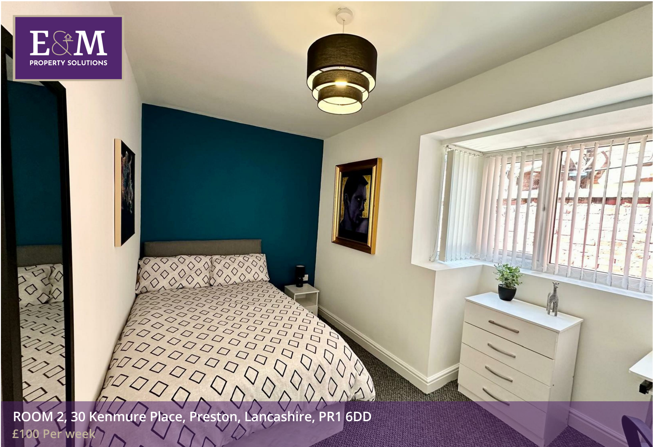
ROOM 2, 30 Kenmure Place, Preston, Lancashire, PR1 6DD £100 Per week