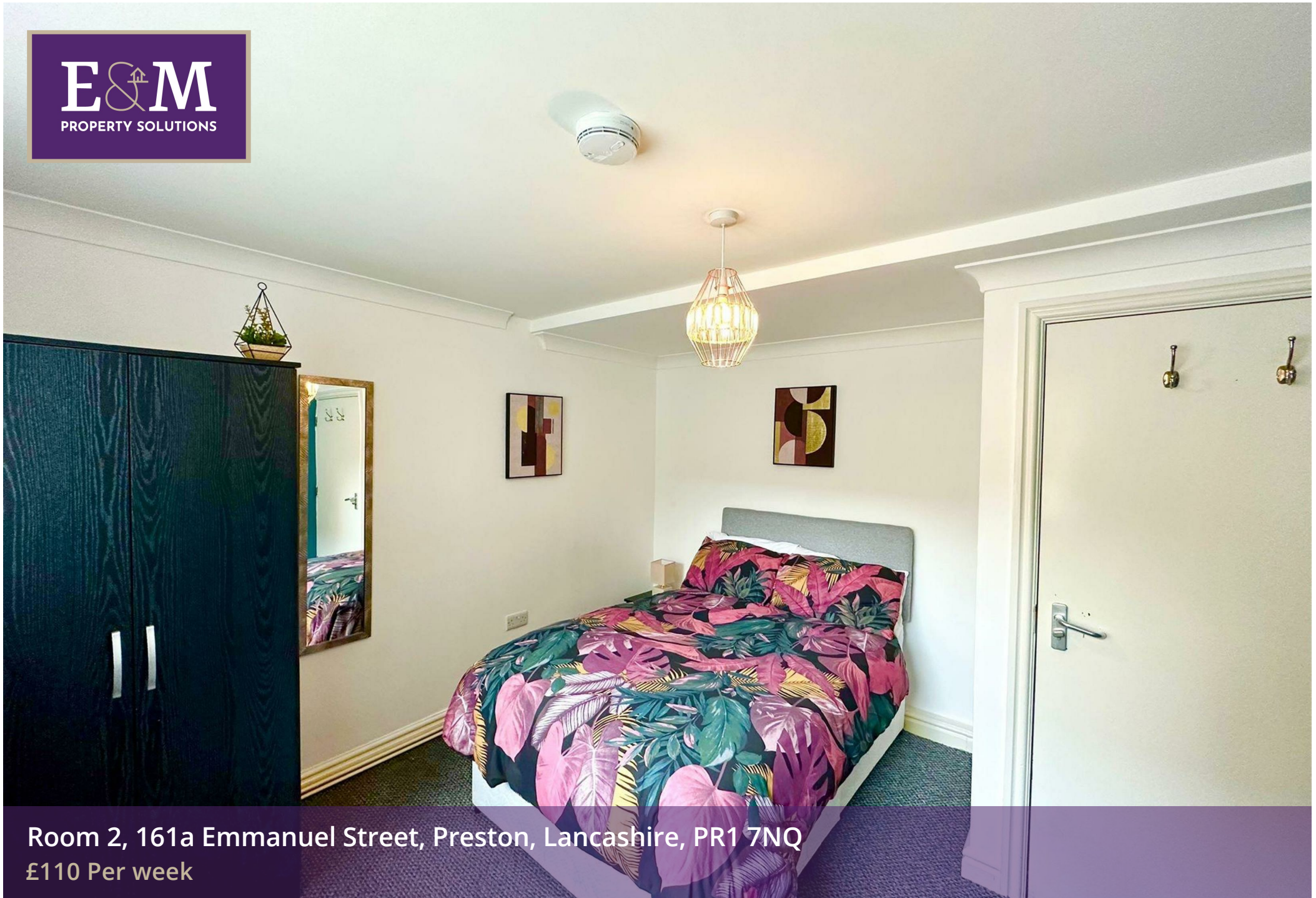
Room 2, 161a Emmanuel Street, Preston, Lancashire, PR1 7NQ £110 Per week