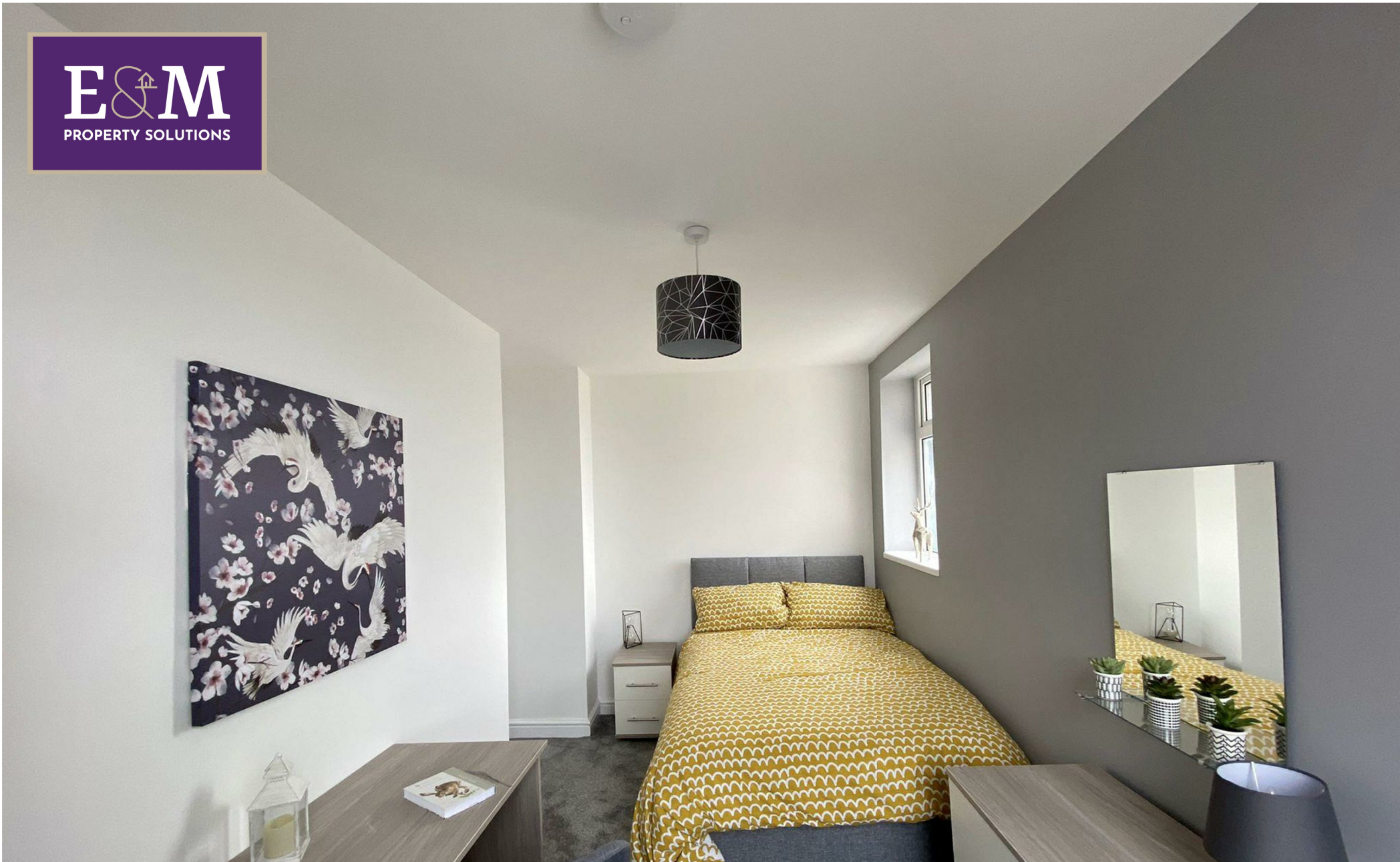
ROOM 4, 837 Briercliffe Road, Burnley, Lancashire, BB10 2HA £130 Per week