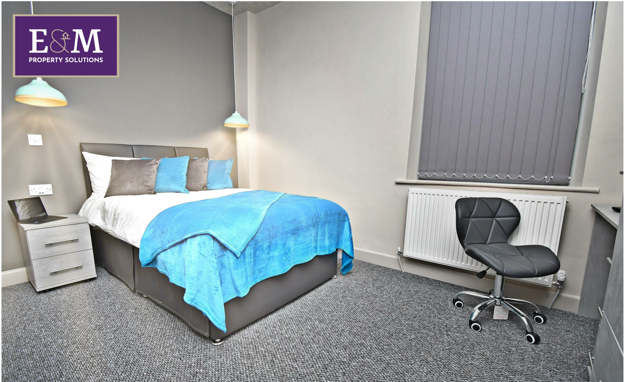
Room 3, 71 Coal Clough Lane, Burnley, Lancashire, BB11 4NS £550 Per week