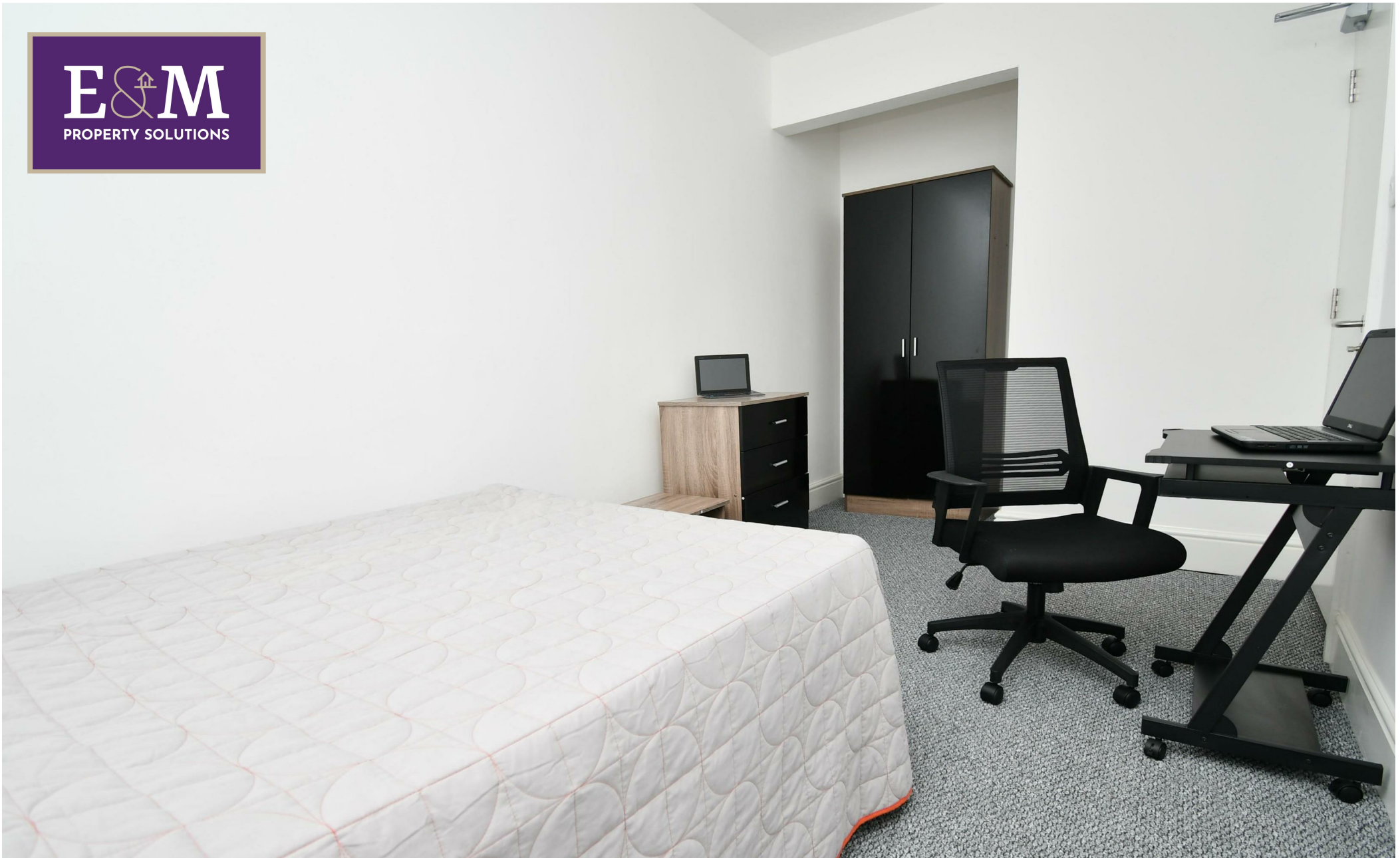
Room 2, 37 Albert Street, Burnley, Lancashire, BB11 3DB £95 Per week