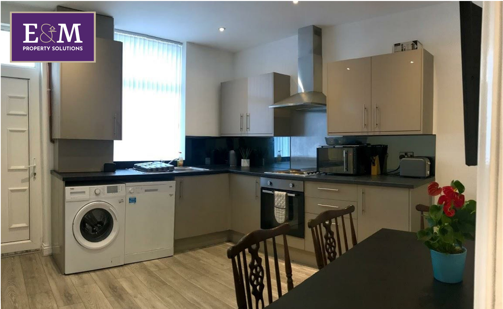
Room 2, 48 Heath Street, Burnley, Lancashire, BB10 3BL £140 Per week