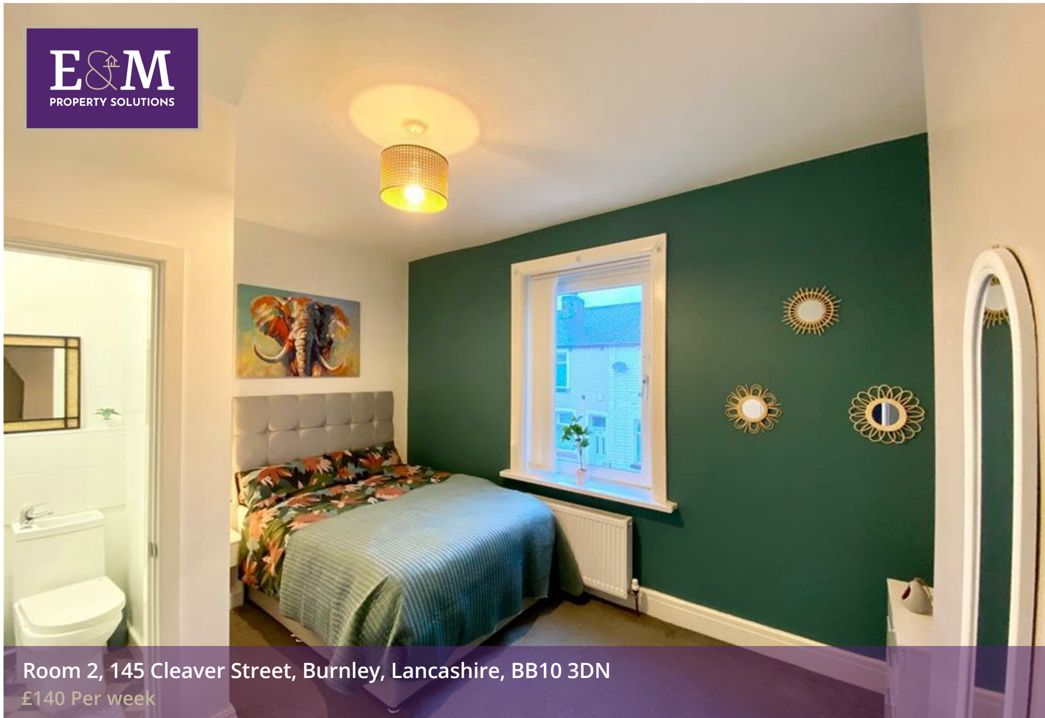
Room 2, 145 Cleaver Street, Burnley, Lancashire, BB10 3DN £140 Per week