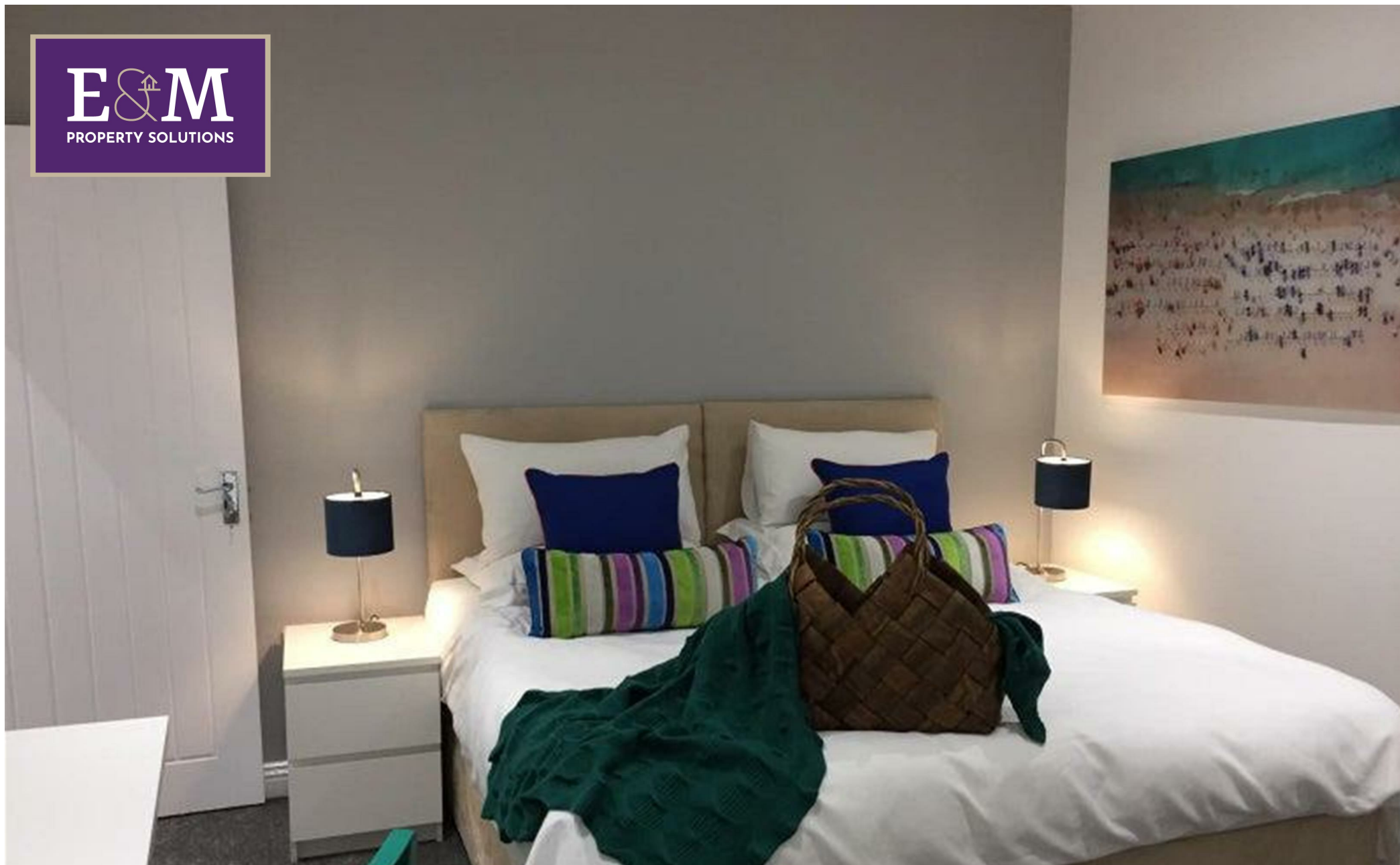
Room 5, 27 Ivan Street, Burnley, Lancashire, BB10 1ES £95 Per week