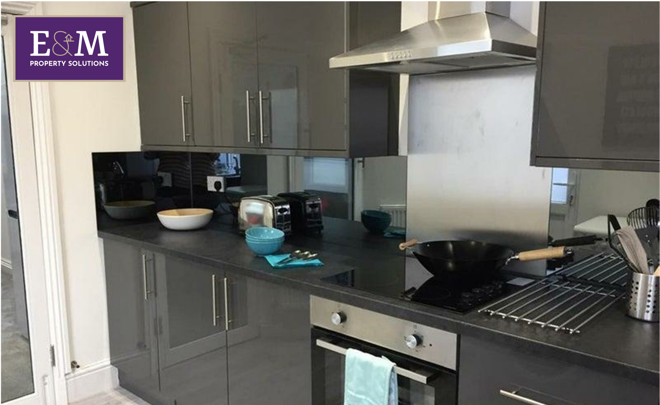
Room 4, 27 Ivan Street, Burnley, Lancashire, BB10 1ES £90 Per week