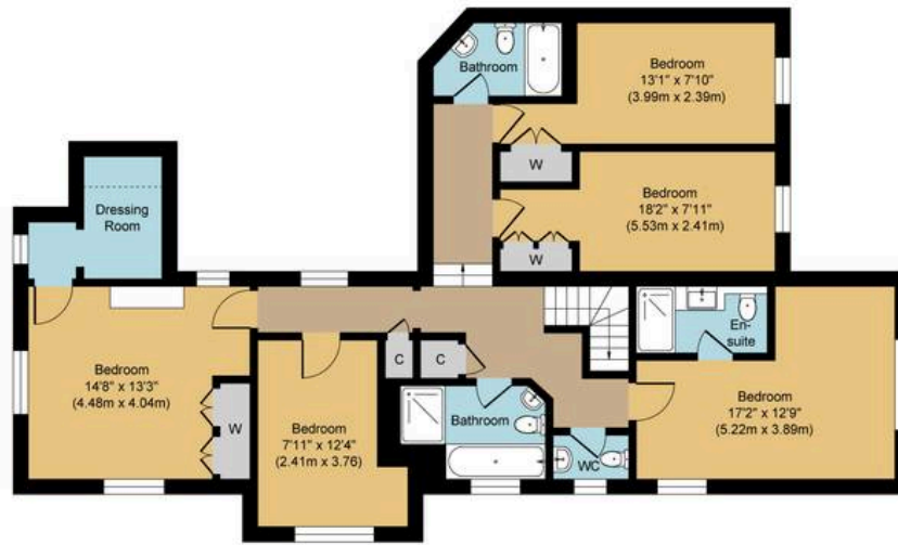
First Floor Approximate Floor Area 1208 sq. ft (112.22 sq. m)