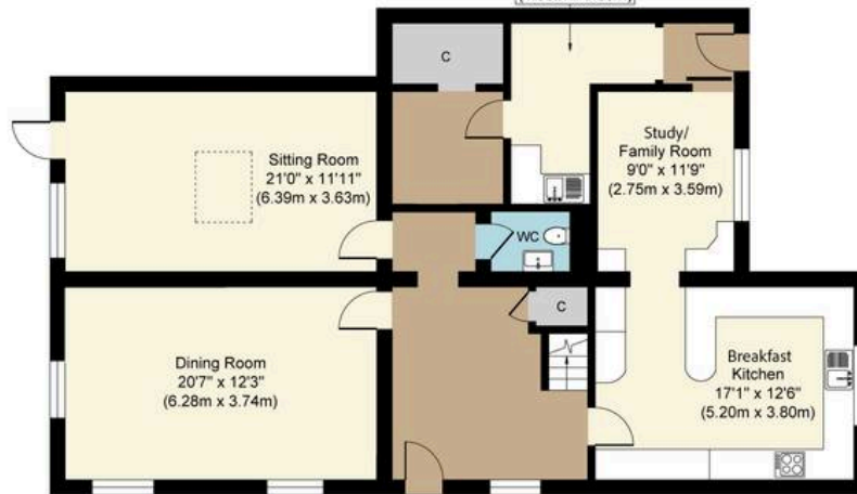
Ground Floor Approximate Floor Area 1330 sq. ft (123.58 sq. m)