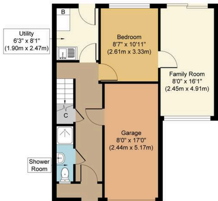
Ground Floor Approximate Floor Area 562 sq. ft (52.21 sq. m)