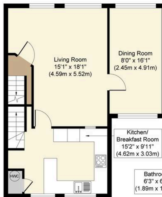
First Floor Approximate Floor Area 562 sq. ft (52.21 sq. m)