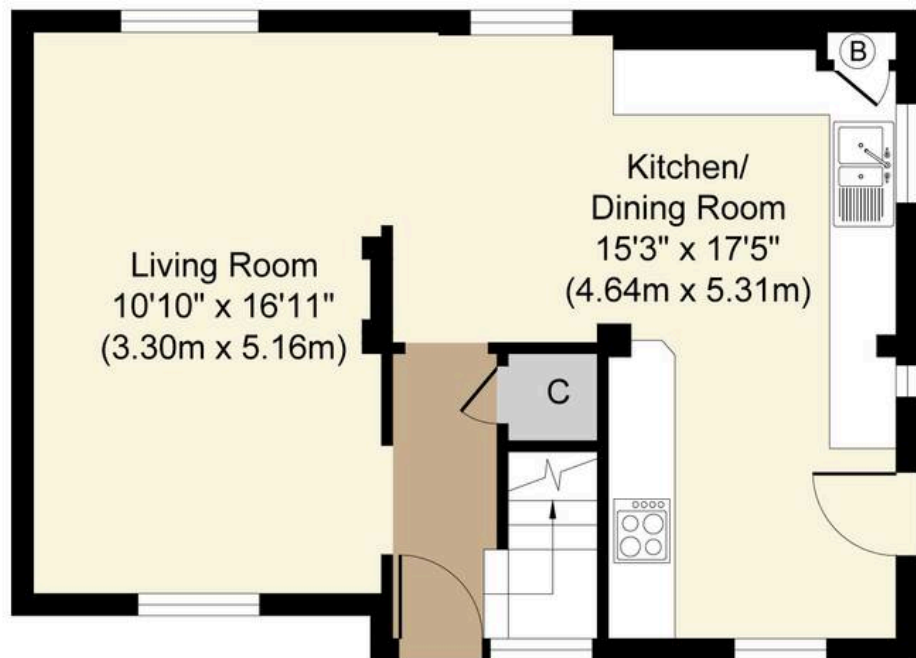
Ground Floor Approximate Floor Area 441 sq. ft (40.97 sq. m)