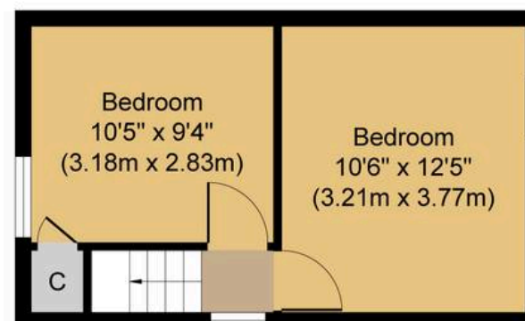
First Floor Approximate Floor Area 275 sq. ft (25.58 sq. m)