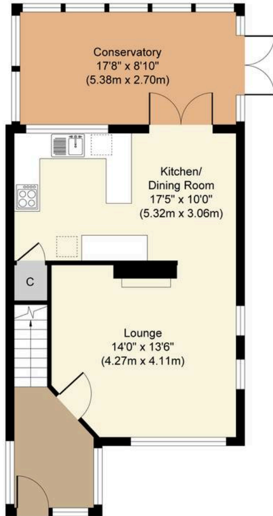
Ground Floor Approximate Floor Area 624 sq. ft (57.99 sq. m)