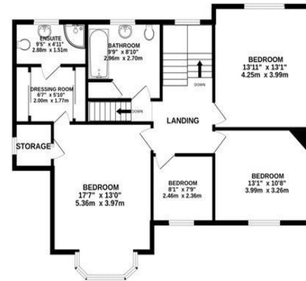
1ST FLOOR 946 sq.ft. (87.9 sq.m.) approx.