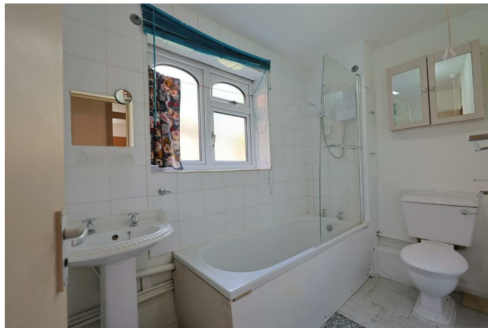
Bathroom 4'11" x 8'10" (1.50 x 2.70)