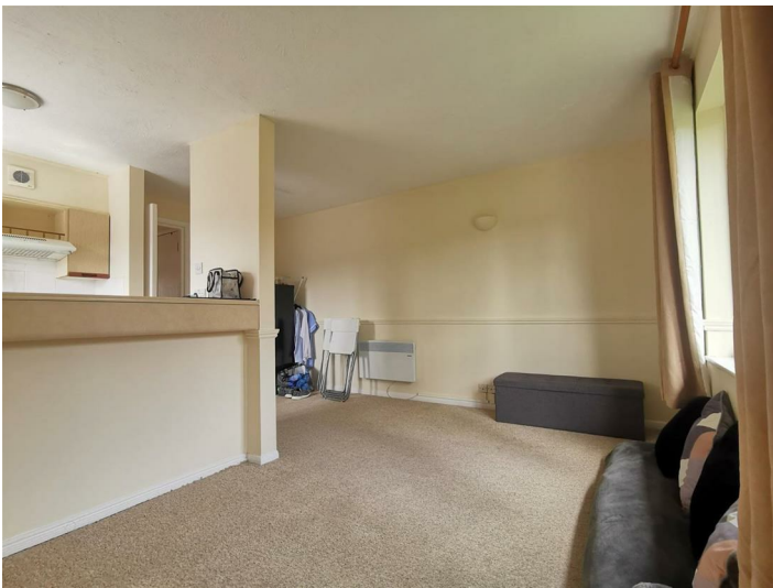
Double glazed window to side aspect and laid to carpet.