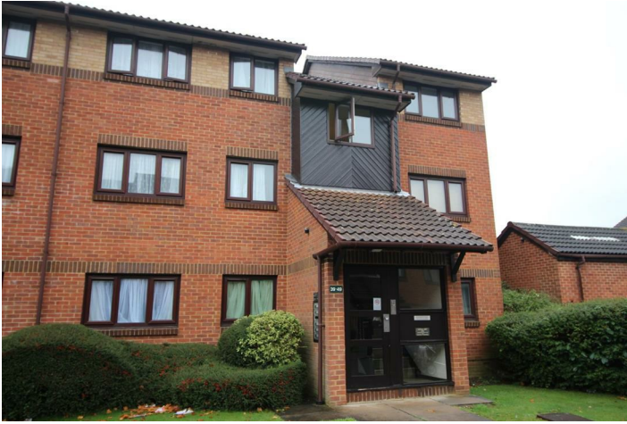
Fob access, stairs leading to second floor entrance.