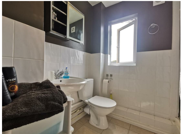
Walk in shower, wall attached pedestal sink with vanity mirror, low level W/C,