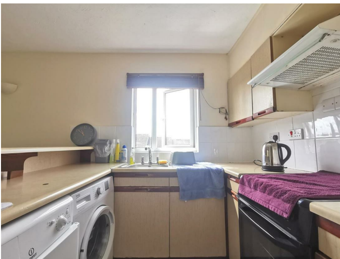
Range of wall and base units, electric cooker with extractor hood over, washing machine, double glazed window to rear aspect, tiled throughout.