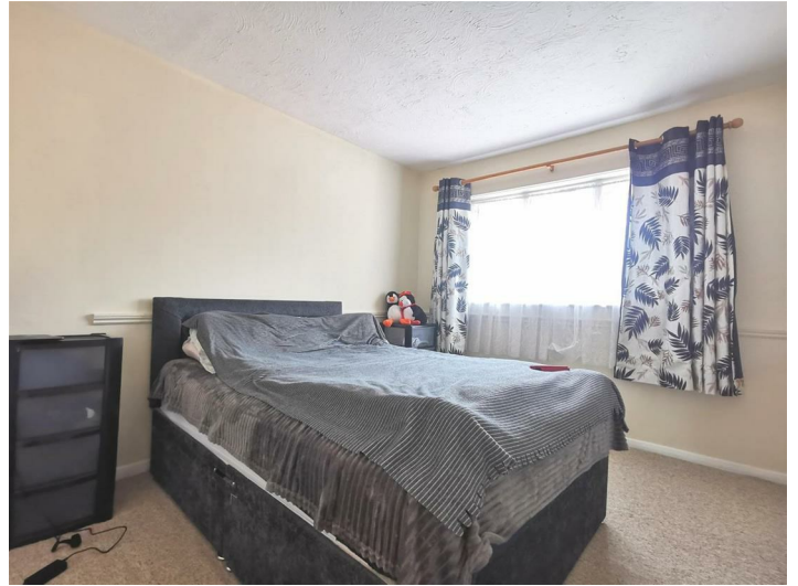
Double glazed window to side aspect and laid to carpet.