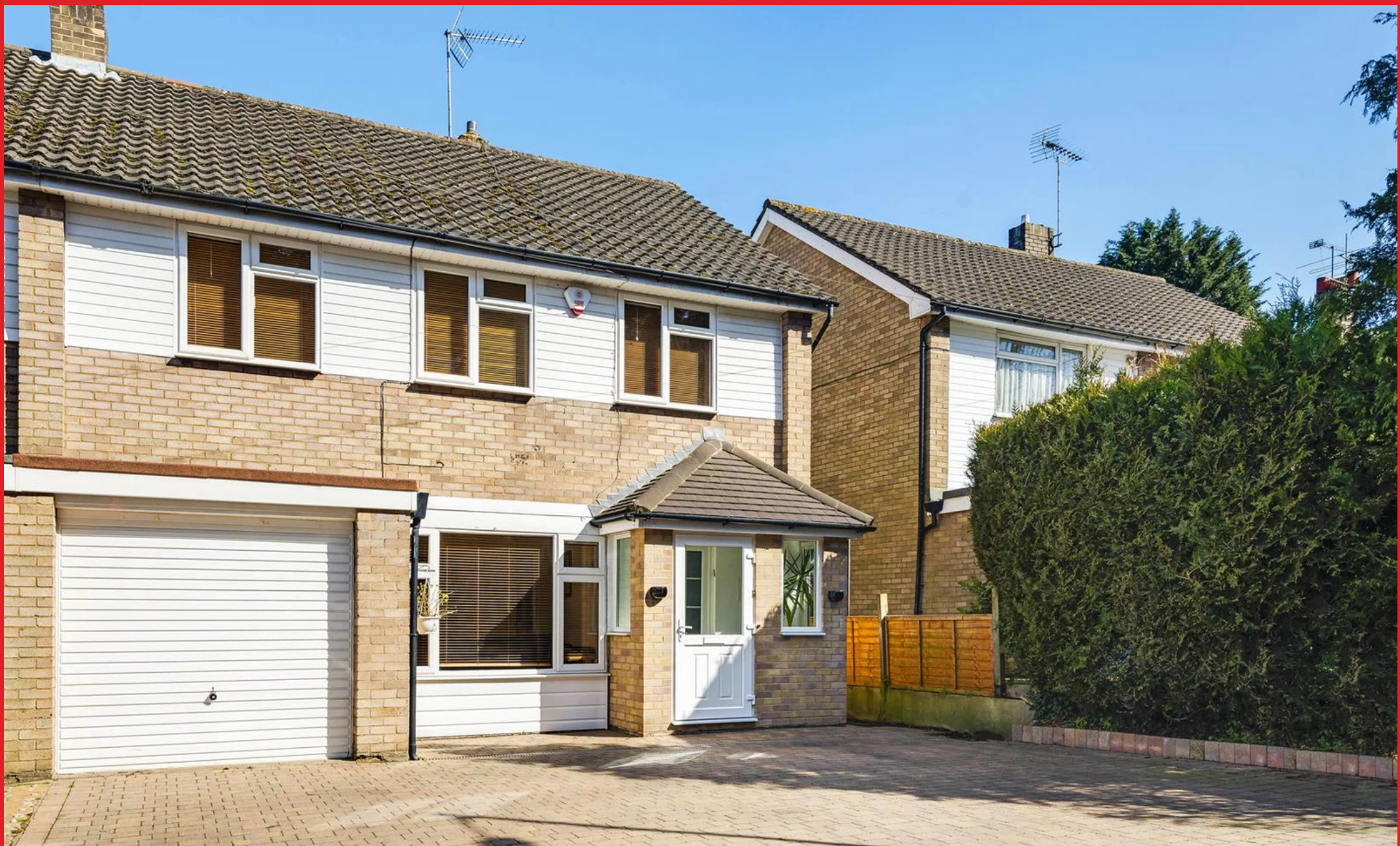
Little Bushey Lane, Bushey Bushey