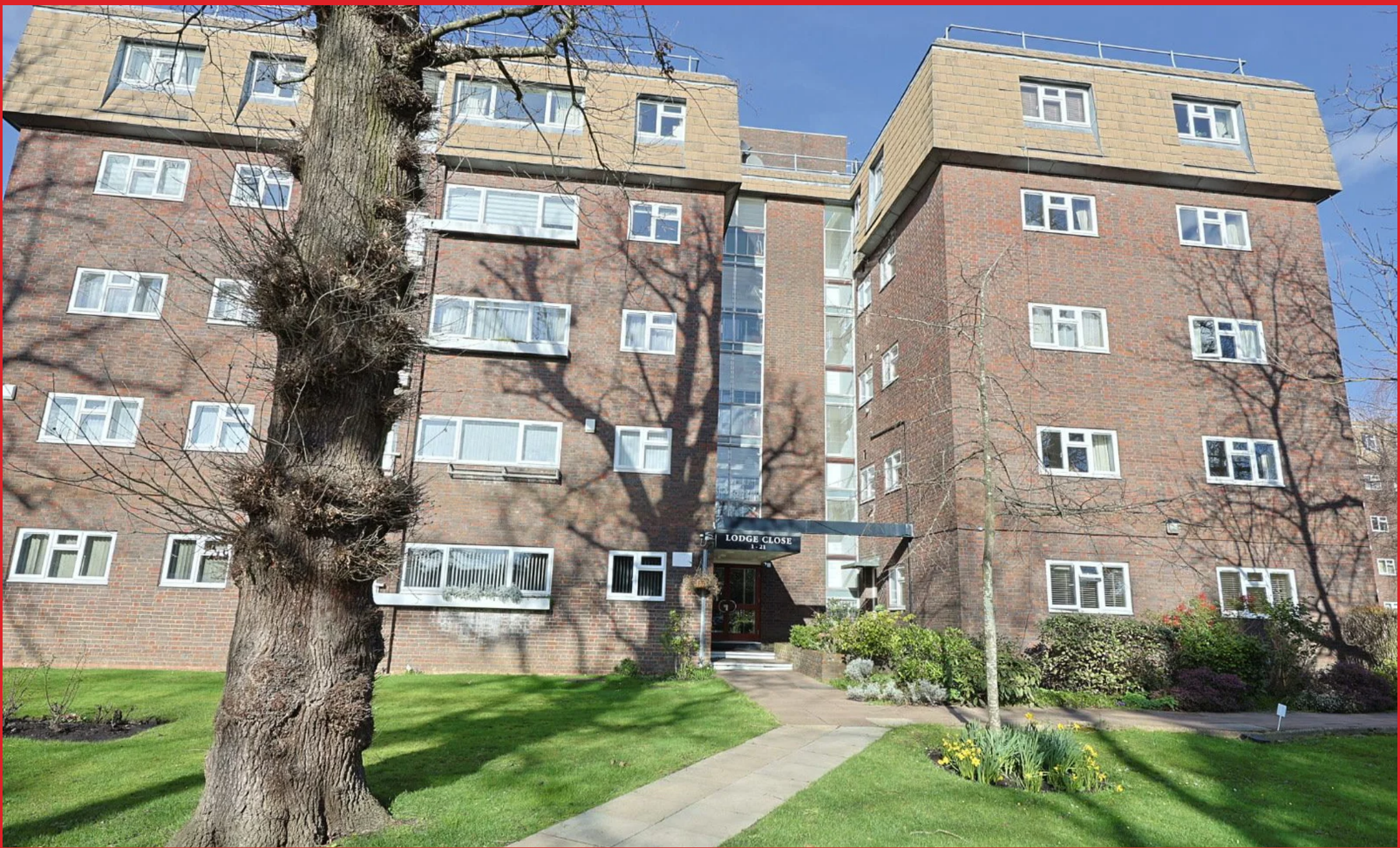
Lodge Close, Edgware Edgware