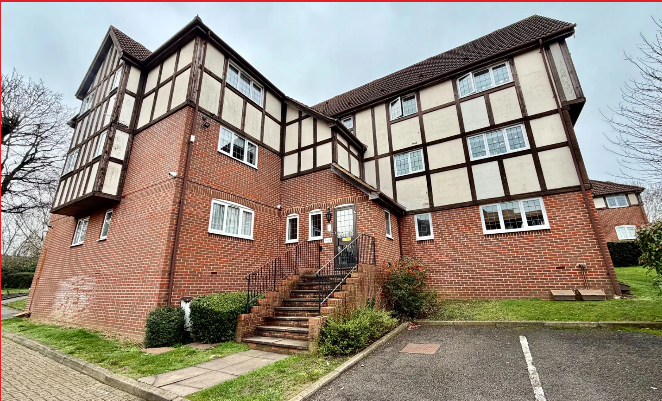
Priory Field Drive, Edgware Edgware