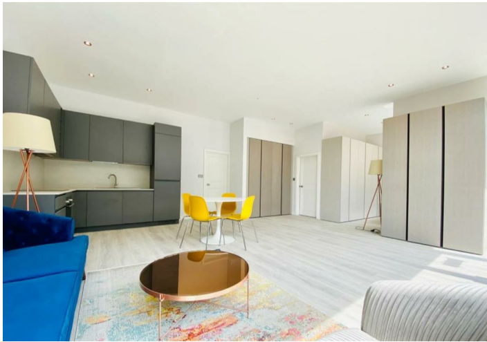
Showroom picture 2