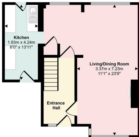
Ground Floor Approx 46 sq m / 492 sq ft

Approx Gross Internal Area 91 sq m / 982 sq ft