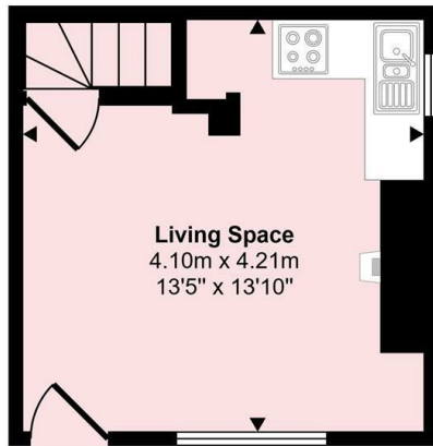
Ground Floor Approx 17 sq m / 185 sq ft

Approx Gross Internal Area 35 sq m / 377 sq ft