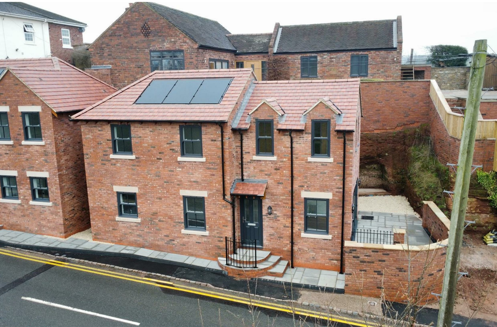
Caunsall Road, Caunsall DY11 5YH