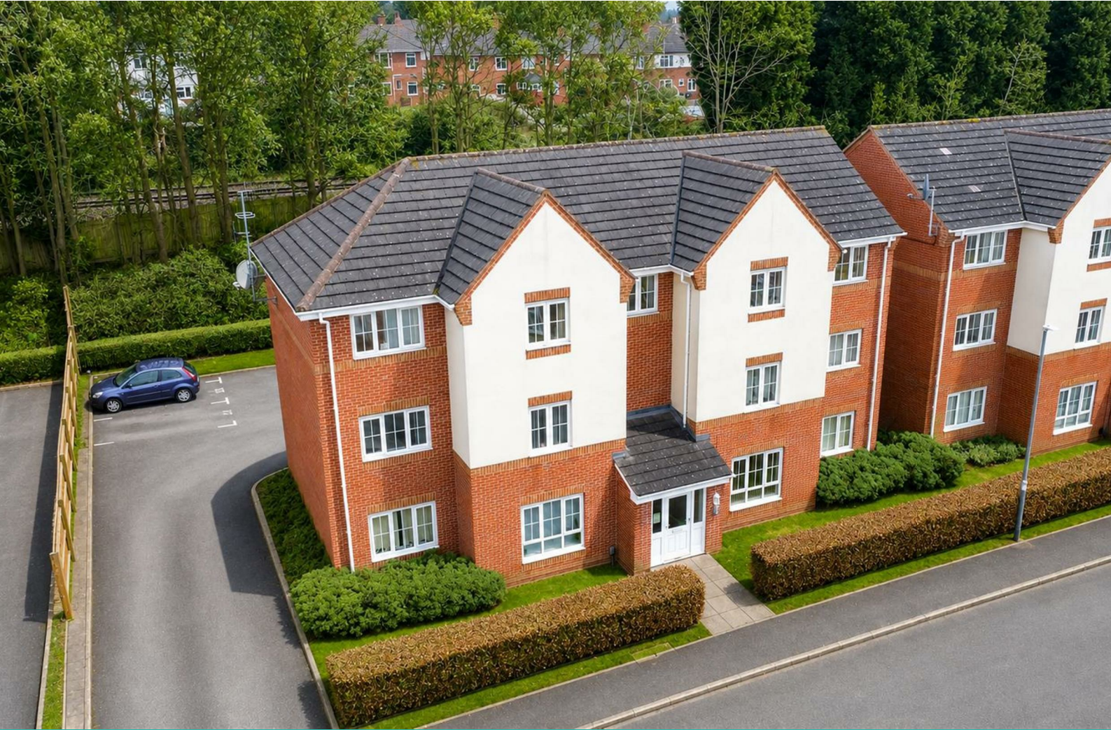
24 Unitt Drive, West Midlands B64 6DB