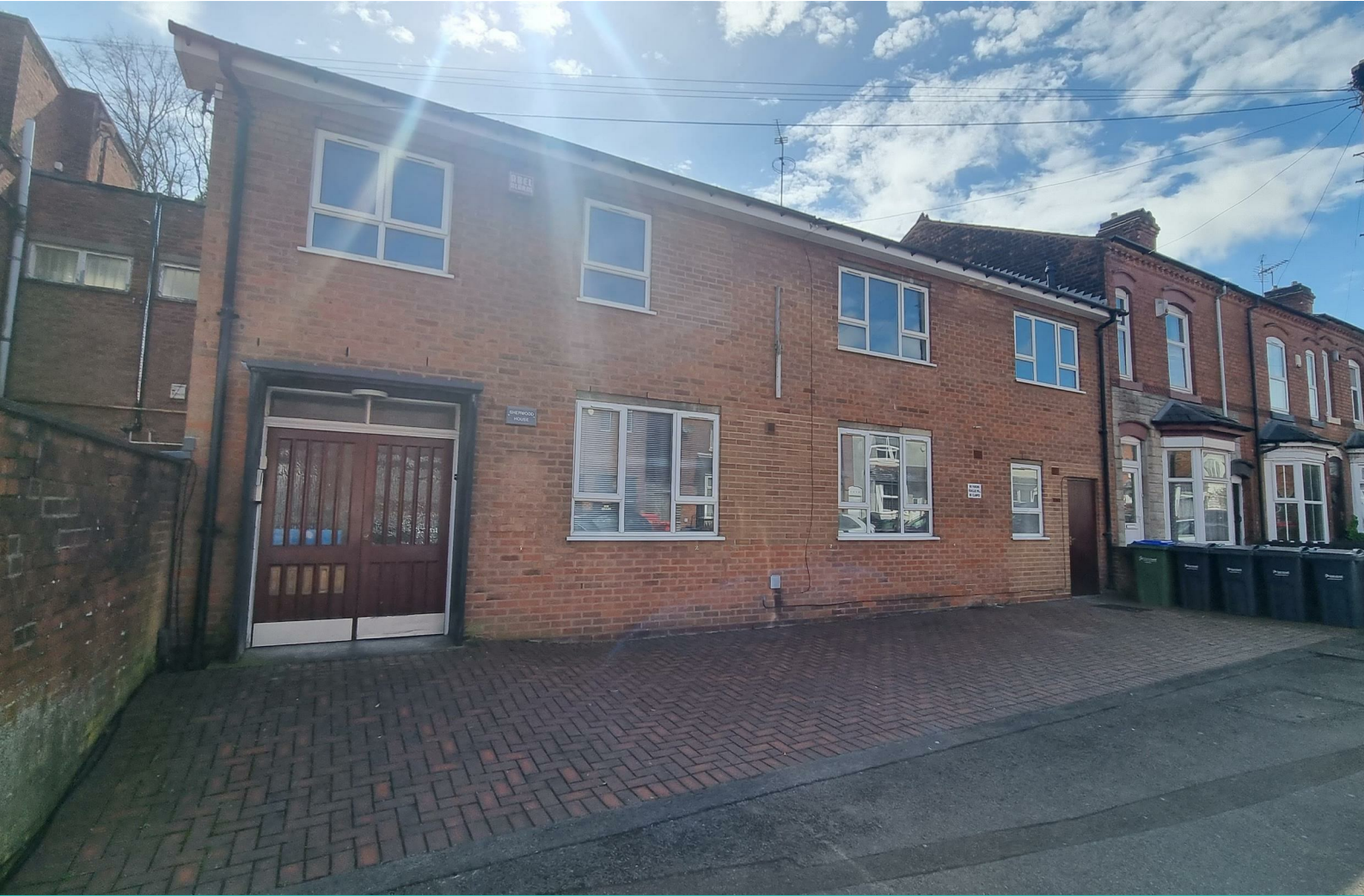
Sherwood House, Bearwood B67 5DE