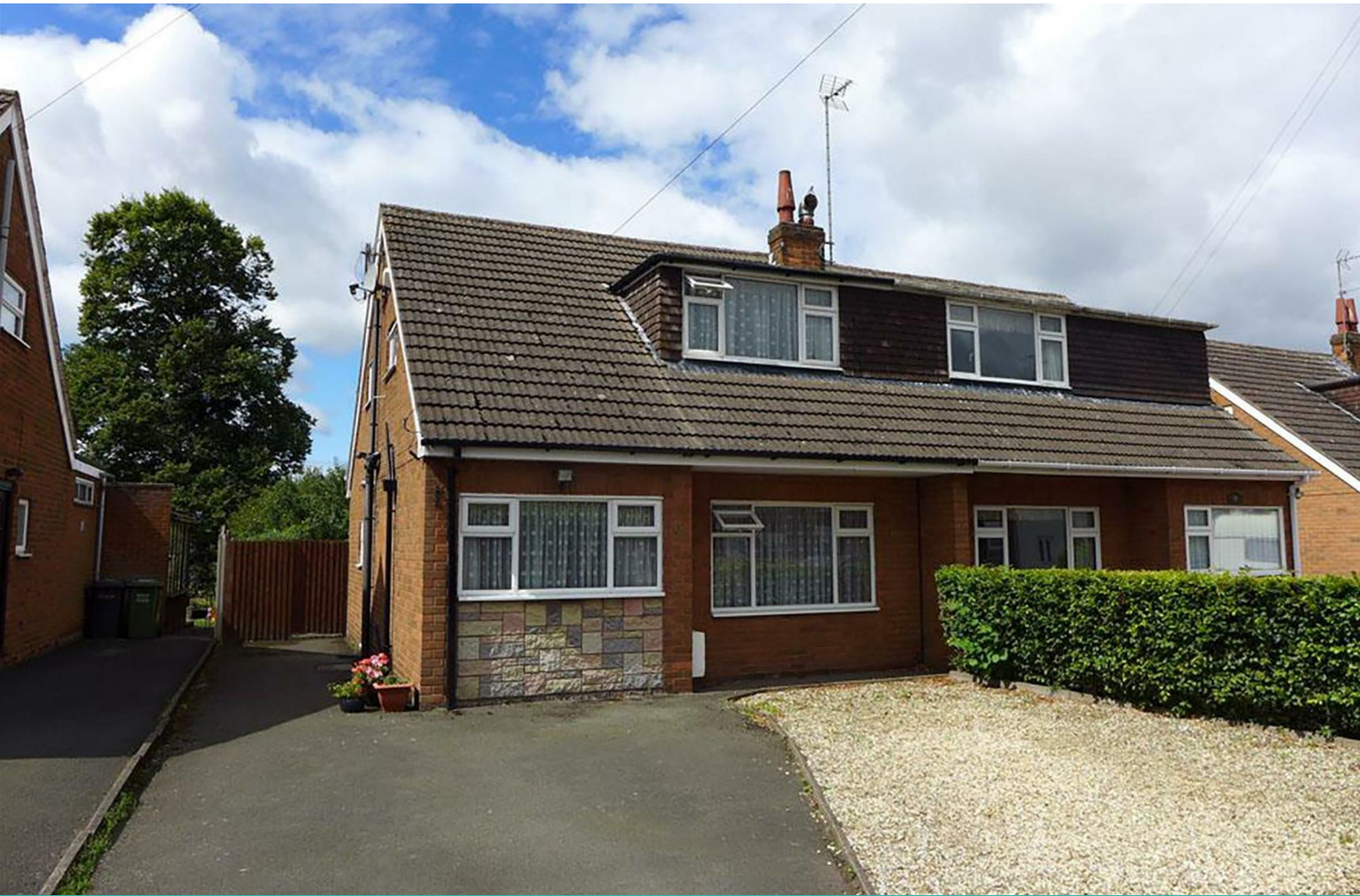
9 Bridge Road, Nr.Kidderminster DY10 3SA